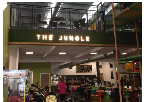
Air is ducted to outlet grilles on both levels of the building, with a return flow via extraction points on the ground floor.